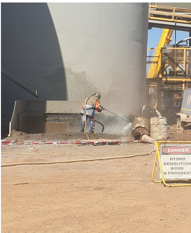
Hydro blasting ahead of concrete repair

GRES mobilised to site and commenced work in July. The remedial works are being executed to high standard and remain on schedule and on budget.