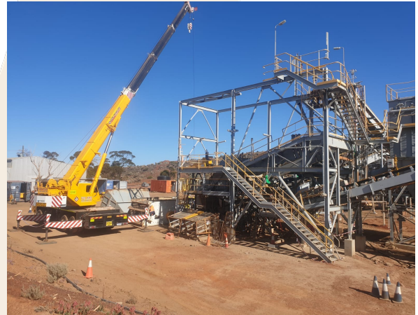
Screen house pulled down ahead of installation of new and improved double screen deck