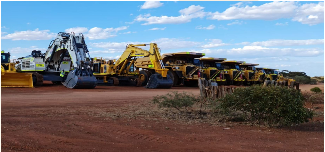
Earthmoving fleet at Riverina

The open pit mining contractor was engaged during the quarter and mobilisation of the mining fleet commenced. Mining operations are scheduled to commence in October 2020.