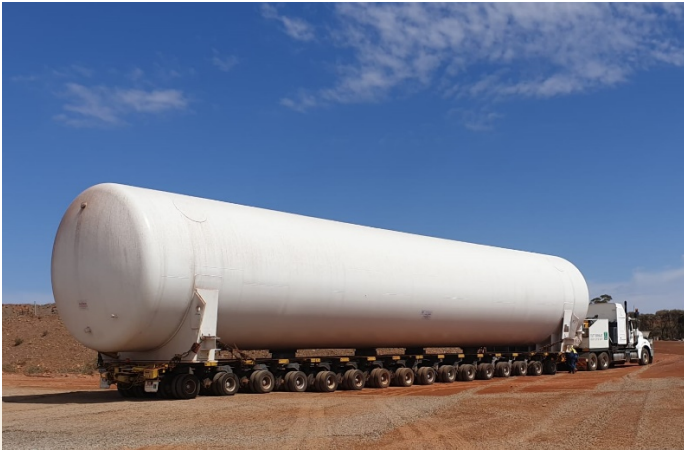
Gas storage bullet arrives on site