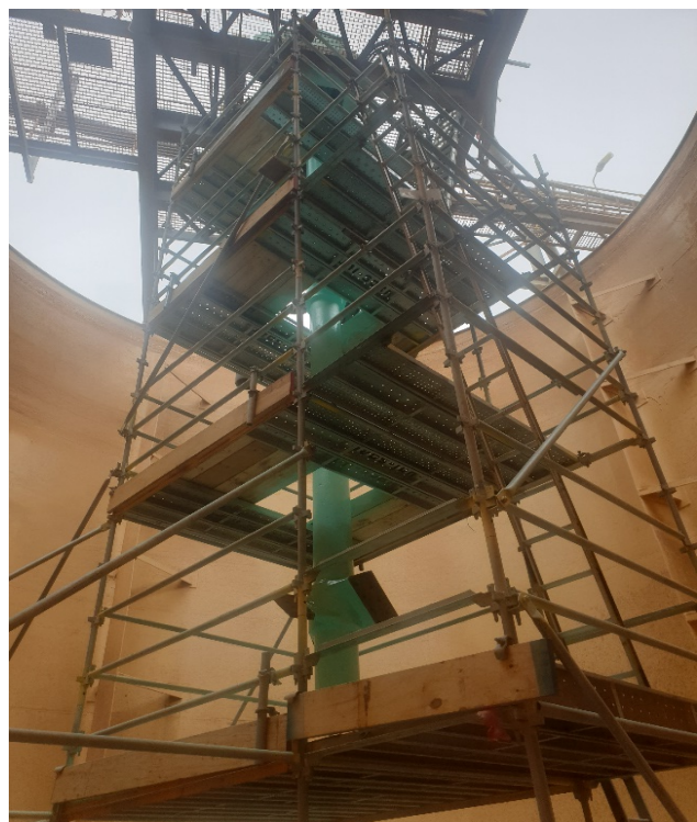
Surface treatment within the leach circuit