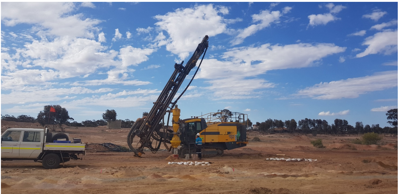
Grade control drilling ongoing

A 21,000 metre grade control drilling program commenced ahead of the commencement of mining operations. A total of 10,098 reverse circulation metres were completed during the quarter.