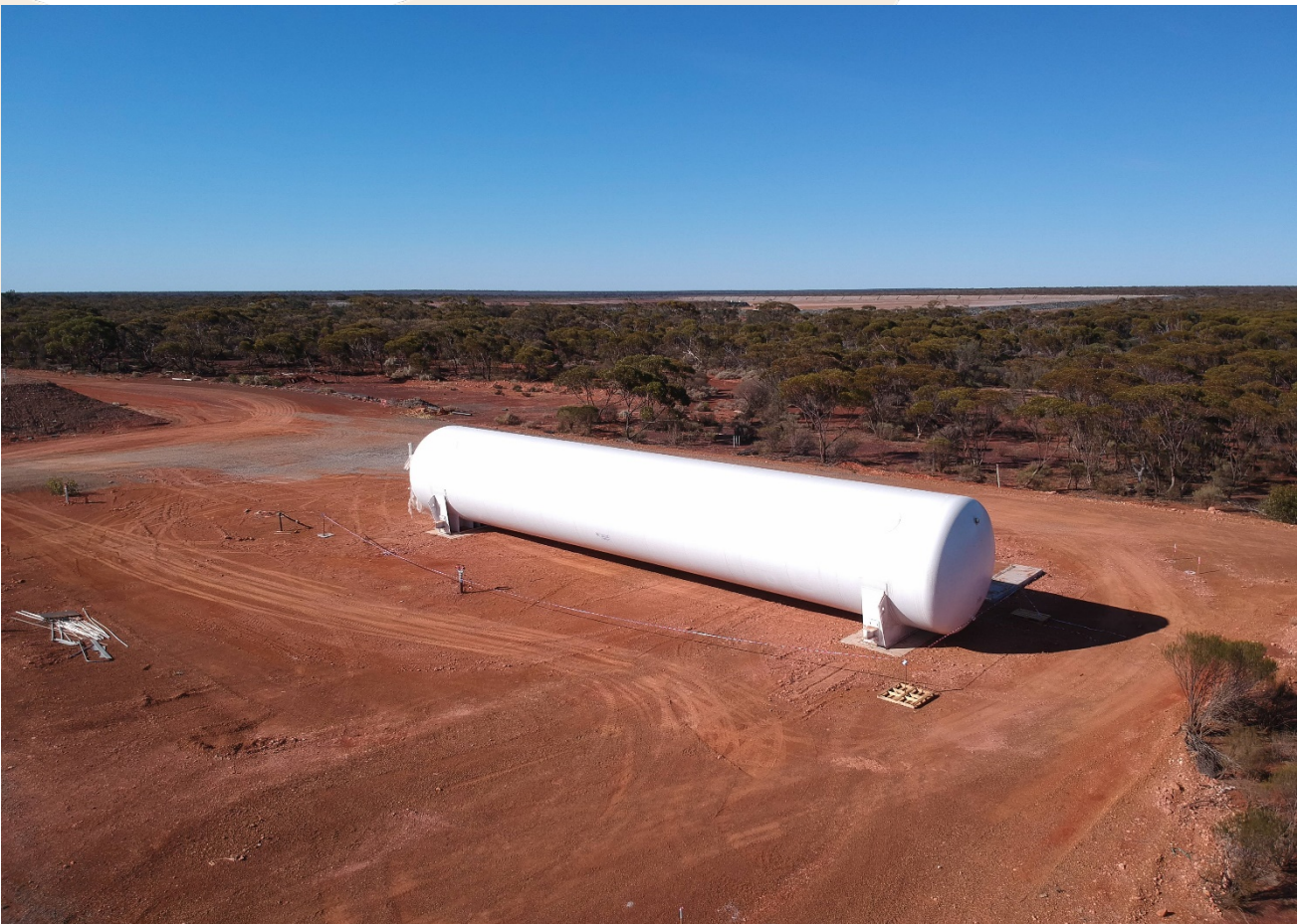
LNG gas storage bullet in position at Davyhurst

Gas storage bullet for power station gas supply which was constructed in China has been delivered to site.